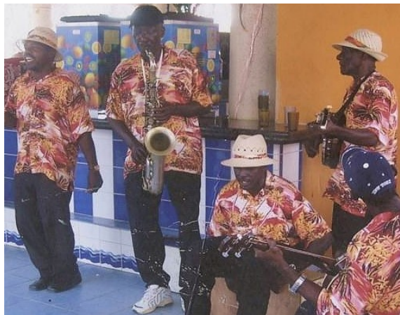
The Mighty Beestons Menta Band, Beeston, Spring, Westmoreland