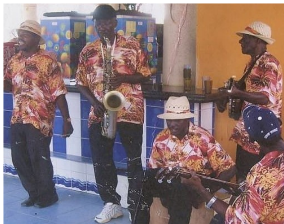
The Mighty Beestons Menta Band, Beeston, Spring, Westmoreland