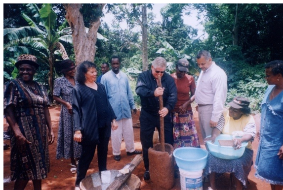
Sandals Chairman Gordon Butch Stewart is hosted by Resource Village